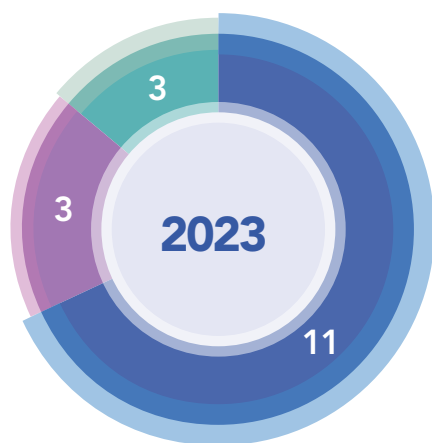
● Hong Kong 香港 2023 二零二三年

The Group's major business suppliers include providers of I.T. products, cloud services, legal, audit, and other business services. They are not considered to pose significant environmental and social risks to the Group's business operations. During the Reporting Period, the Group engaged a total of 17 suppliers (2022: 19 suppliers), as illustrated below: